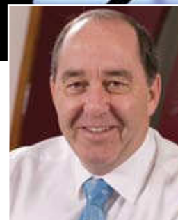
The Hon Robert Borbidge AO

The CEC Group will be conducting a series of investor information sessions in December. These events are open for shareholders, potential investors and institutions and it provides an opportunity to meet with Senior CEC Group personnel and Board Members. On behalf of the CEC Group, the Chairman, The Hon Robert Borbidge AO, invites all interested parties to attend.